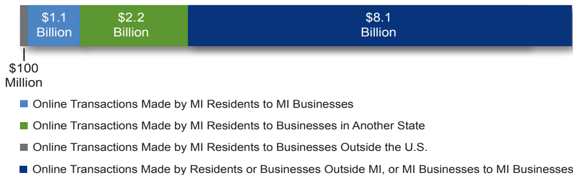
Figure 2. Total Value of Online Transactions in Michigan

Across the state, an estimated 2.6 million Michigan adults went online to buy goods or services from Michigan businesses in the 12 months prior to taking the survey. On average, each of these online shoppers made seven online purchases from in-state vendors, at an average value of $409.53 per buyer during the course of the year. Altogether, this translates into more than 17.1 million transactions worth nearly $1.1 billion in annual online sales to Michigan businesses. This does not include the $2.2 billion that Michigan residents spent with vendors in other states across America and the $100 million spent with international vendors (Figure 2).