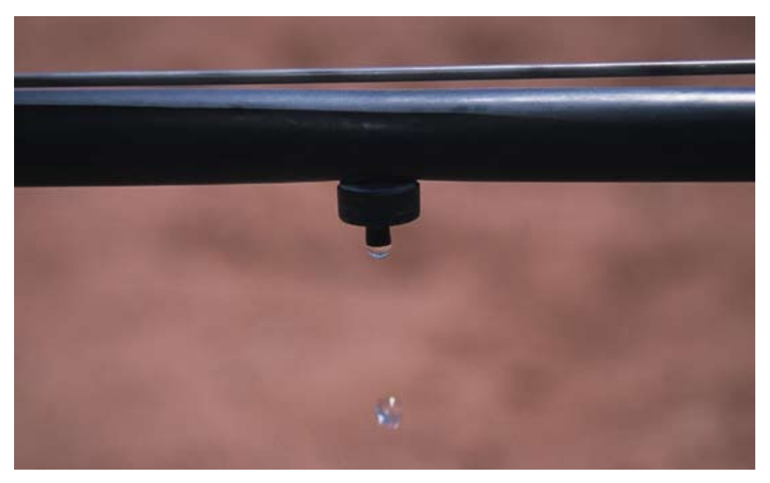
Drip irrigation systems allow water to be applied to individual plants, thereby reducing evaporation.