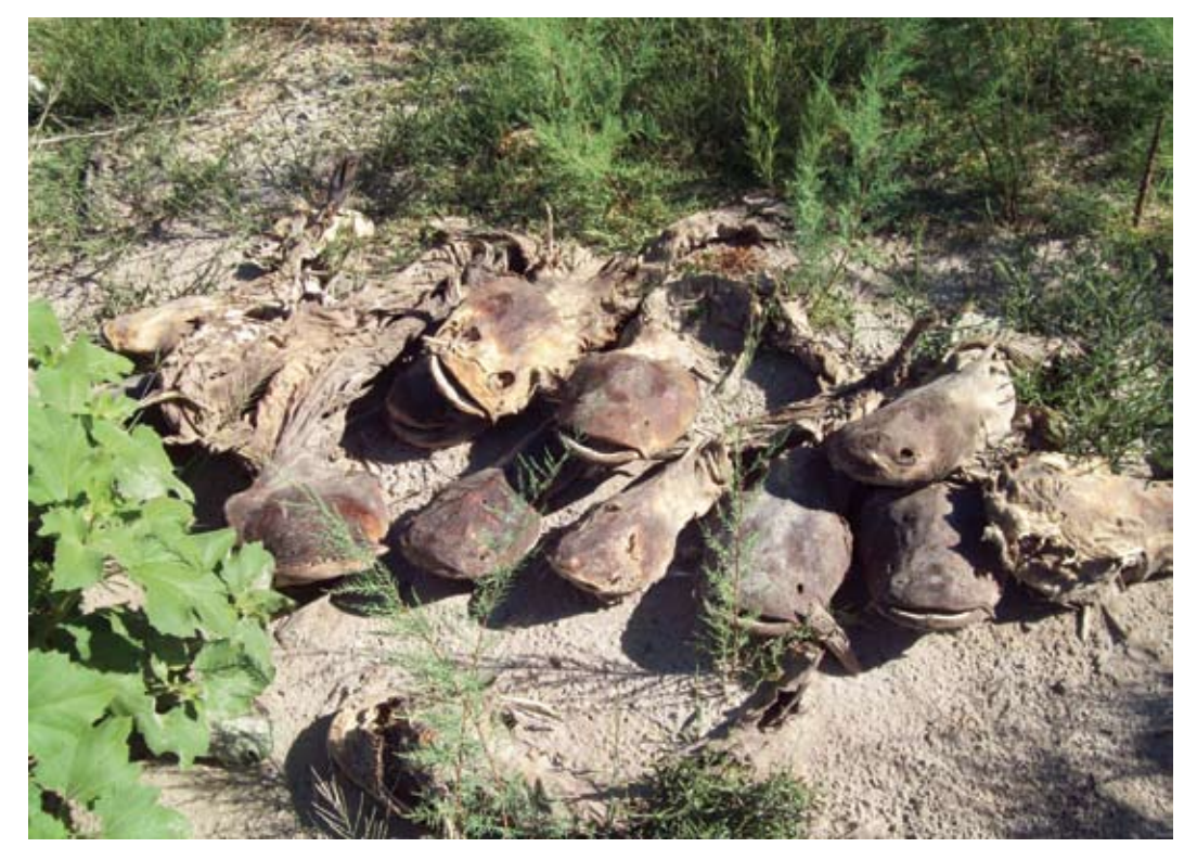
Low water levels caused the death of these fish in O.C. Fisher Lake near San Angelo.

Water-based recreation, such as fishing and boating, is also impacted by declining water levels. This is significant in a state that ranks second nationally in angler days and sixth for number of boats registered for use.<sup>16</sup> Low water levels in lakes, rivers and streams impede recreation, as many boat ramps close when water levels decrease and algal blooms disrupt opportunities to fish.<sup>17</sup> The drought has measurably reduced outdoor recreation by Texans: visitor fees paid at Texas state