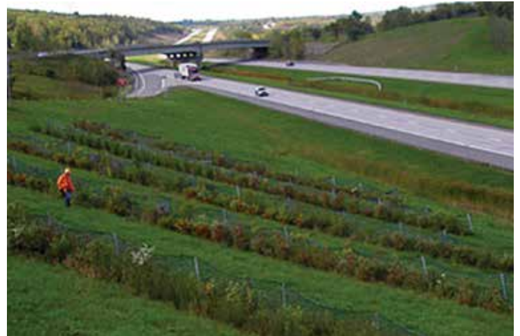
Living snow fences.

GreenLITES was recognized in 2009 by the Council of State Governments under their prestigious Innovations Award program, and in 2010 received the AASHTO President's Award for Environment.