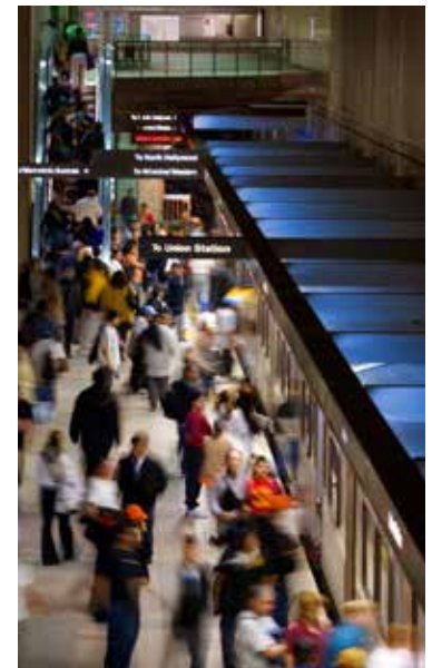
LA Metro red line at Union Station.

The LACMTA's Board has put sustainability front and center in its vision for the agency's future. In 2008, voters approved Measure R , which authorizes LACMTA to spend a projected $40 billion on traffic relief and transportation upgrades throughout the county over the next