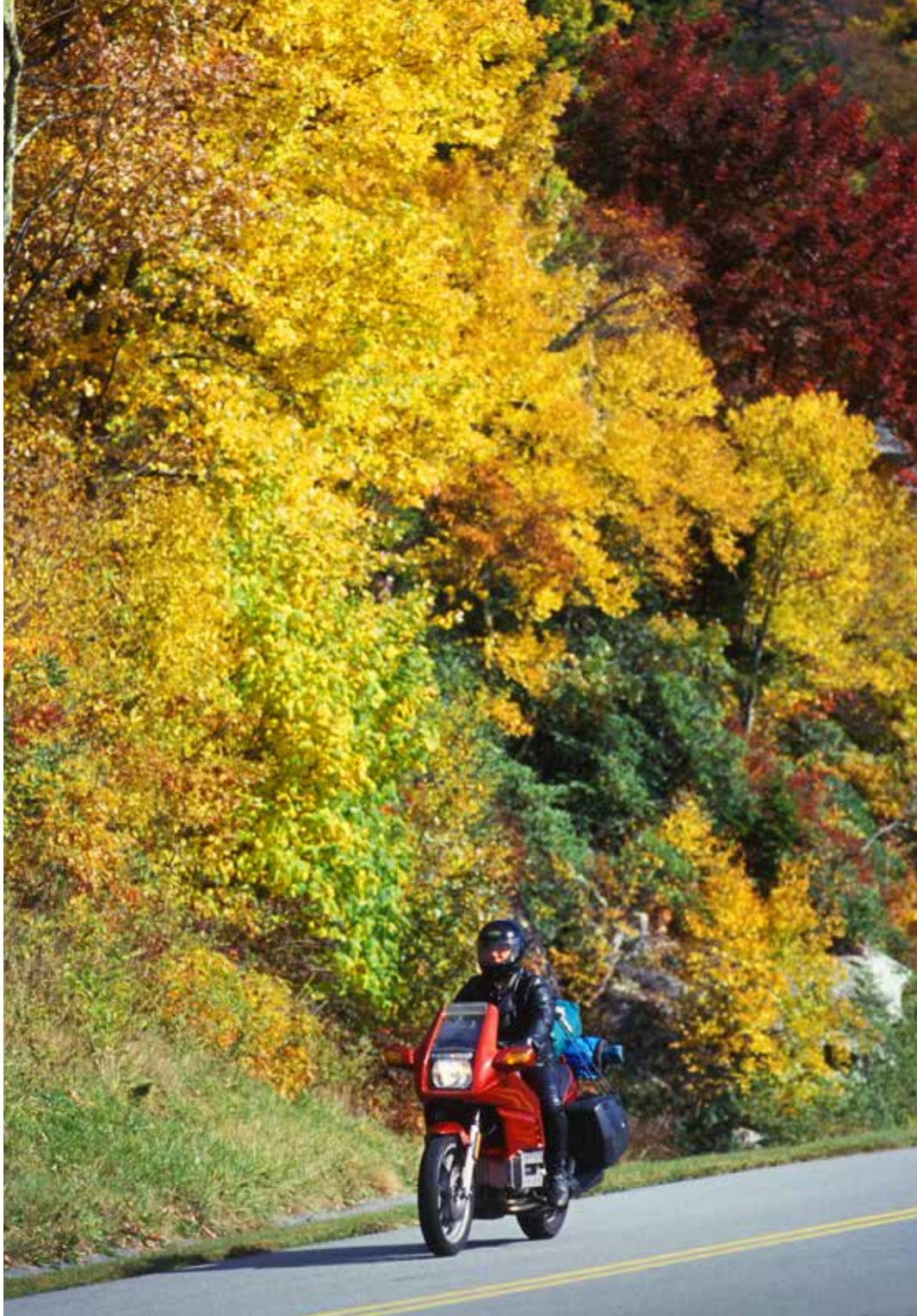
Motorcyclist travels along the Blue Ridge Parkway.