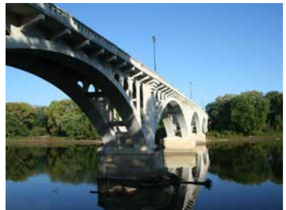
Historic Indiana bridge: Knox.

In 2002, the National Trust for Historic Preservation included Indiana's historic bridges on America's 11 Most Endangered Places list. As a result, bridge owners, funding partners, and preservationists in Indiana recognized the need to find common ground regarding the efficient execution of Section 106 of the Historic Preservation Act and agree on a consistent approach for identifying and preserving historic bridges. FHWA's Indiana Division began working on a solution with INDOT