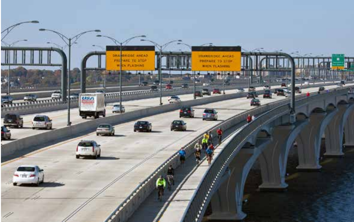
Bike lane along Woodrow Wilson Bridge that spans the Potomac River.

By integrating data sets from dozens of statewide databases and giving users the power to analyze them at the click of a mouse, MOSAIC will help the agency swiftly identify project options to optimize environmental, cost, mobility, safety, and economic considerations, and use this analysis to target transportation improvements that offer the best sustainability performance.