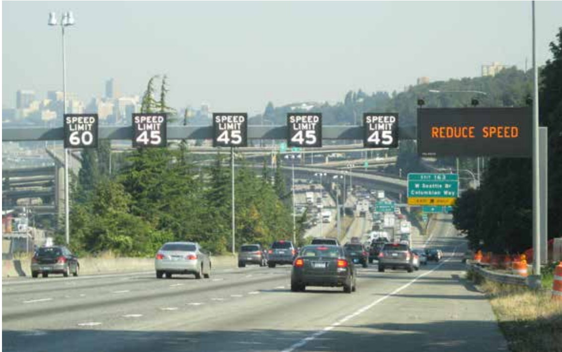
Variable speed lanes.

Detailed recommendations for program changes and major new projects in three major focus areas help transform Transportation 2040 's vision for sustainable transportation into reality: