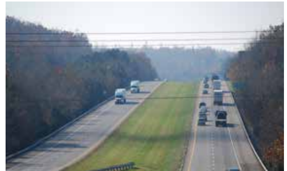
Kentucky, I-65 in Halt County. 2009 Perpetual Pavement Award Winner.