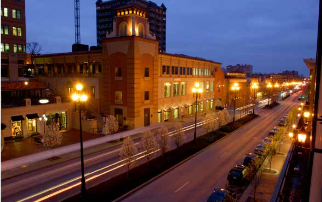
Country Club Plaza Shopping Center in Kansas City, Missouri, at dusk.

binder to drive off moisture and make it pliable. Warm-mix manufacturing technologies brought to the United States from Europe in the early 2000s save energy and costs by allowing for production and placement of asphalt at lower temperatures. Less heat means less fuel and lower emissions and potentially lower fuel costs. Using warm-mix asphalt (WMA) can reduce energy consumption during the manufacturing of the asphalt pavement mixture by an average of 15 to 30 percent, which decreases total life-cycle greenhouse gas emissions by 5 percent. 9 In a two-year performance study conducted for Virginia Department of Transportation, which is one of the states beginning to use WMA, the Virginia Transportation Research Council estimated that using warm-mix asphalt as part of the DOT's maintenance program could provide Virginia with about a $1.15 million annual savings over the cost of hot-mix asphalt, which they attributed to the longer lifespan of WMA compared to regular asphalt. 10