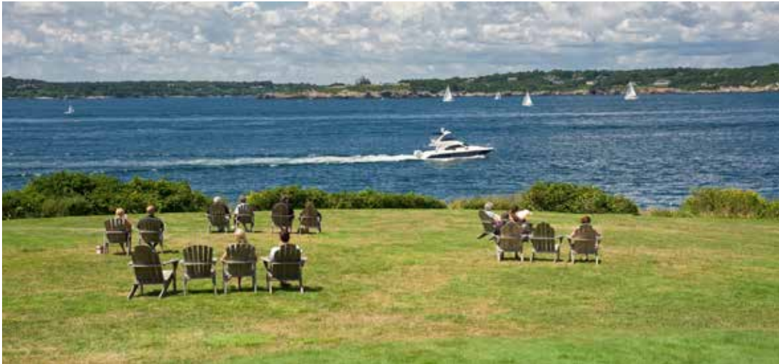
Waterview in Newport, Rhode Island.

Through the Stormwater Solutions outreach effort, more than two dozen training workshops for RIDOT and municipal employees have been completed. The training has included new ways to prevent runoff pollution at public works garages and construction sites; inclusion of improved pollution controls in new project designs, construction practice, and routine maintenance; and designing for green streets and ways communities can make a difference in preventing stormwater pollution.