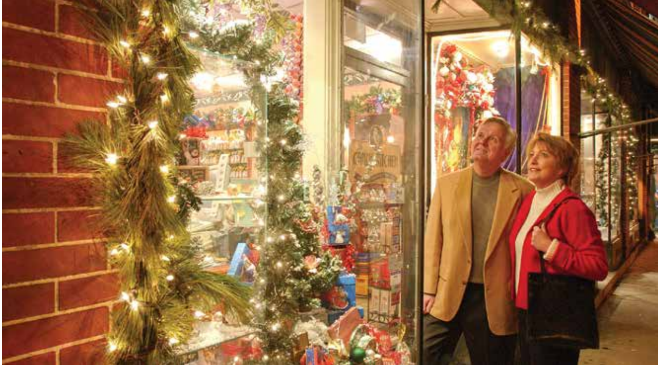
Regardless of season, weather, or day of the week, shopping remains a steady and significant attraction in Frederick County, located conveniently off of US 15.

interchanges or general-purpose lanes. In the future, its capabilities may be expanded to include high-occupancy-vehicle lanes, high-occupancy-toll lanes, express-toll lanes, bus-only lanes, lane removal, light rail, and park-and-ride lots.