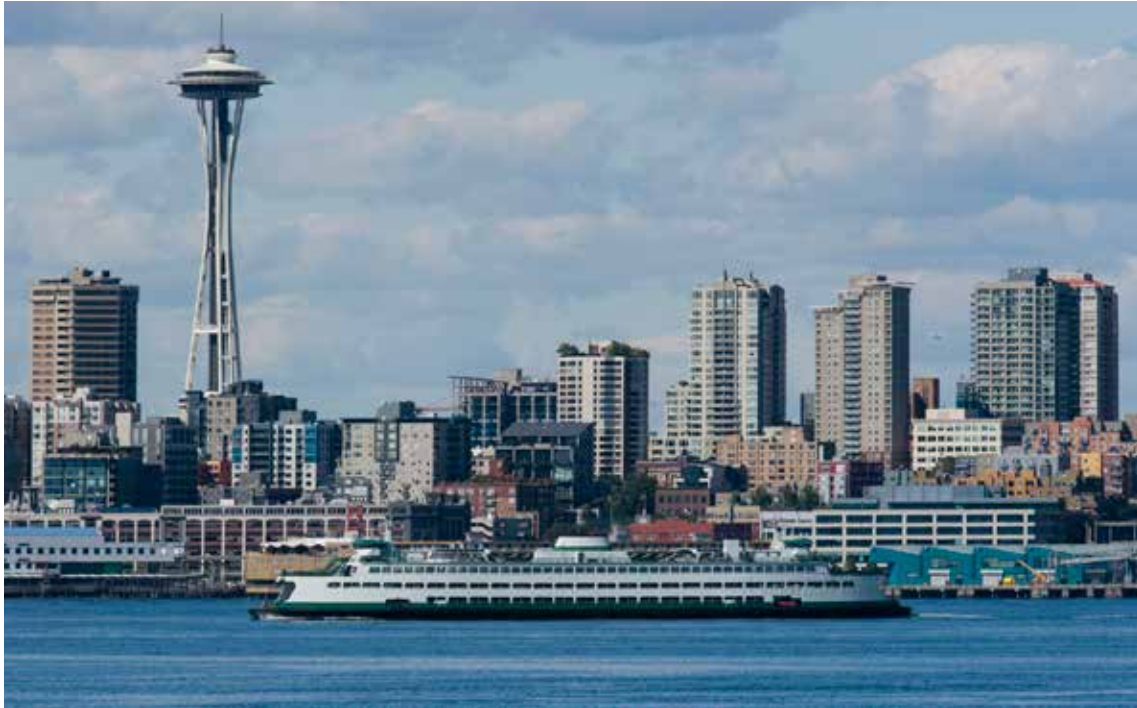
Puget Sound Ferry.

overhead signs displaying variable speed limits, lane status, and real-time traffic information so drivers know what is happening on the road ahead. The first signs were installed on northbound I-5, a major freeway traversing the southern part of Seattle. Since then, WSDOT has implemented similar systems on SR520, completed in November 2010, and I-90, completed in June 2011. Active traffic management improves safety, reduces congestion, and improves the environment. Although more collision data will be needed for a statistical analysis of collision frequency, WSDOT officials expect to see a measurable and statistically significant reduction in collisions. Congestion relief also means reduced fuel consumption as traffic spends less time stuck in jams.