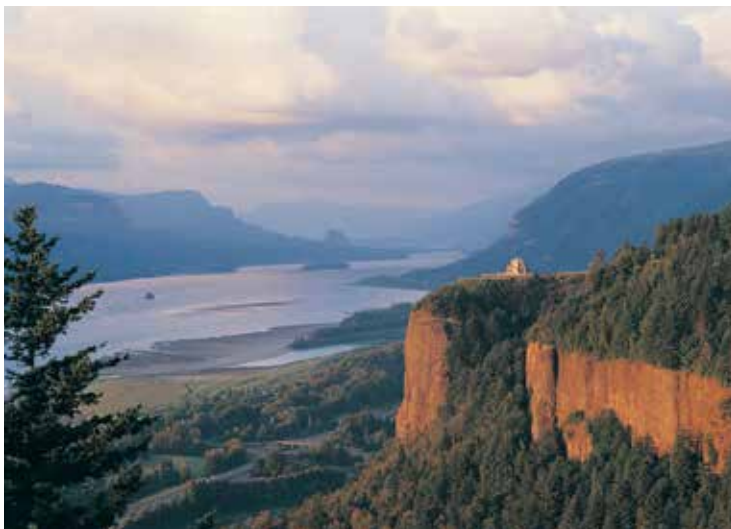
Gorge Highway overlooking the Columbia River.

The long list of sustainable practices and programs overseen by ODOT's sustainability program manager and the cross-discipline ODOT Sustainability Council are documented in an annual sustainability progress report. Some examples