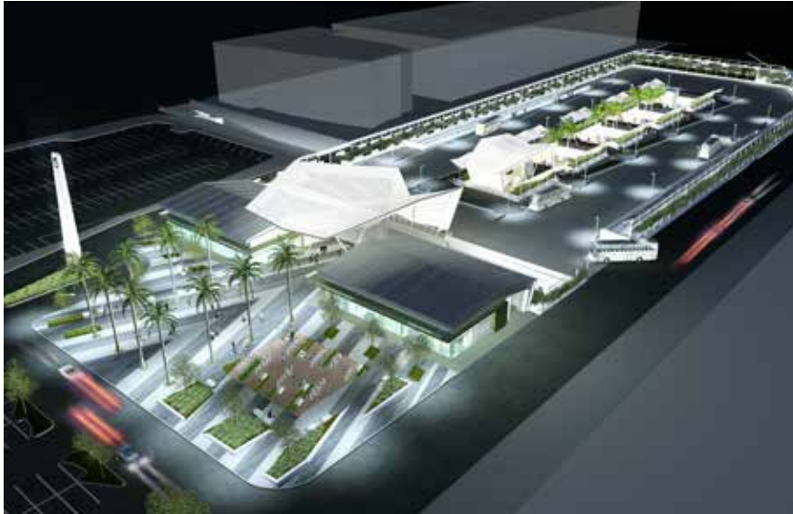
LACMTA bus hub.

30 years. 22 The Board's 2008 Metro Sustainability Implementation Plan was developed to ensure that transportation decisions are fiscally responsible, socially equitable, and exhibit environmental stewardship. 23 Some of the Board's initial sustainability-focused initiatives include: