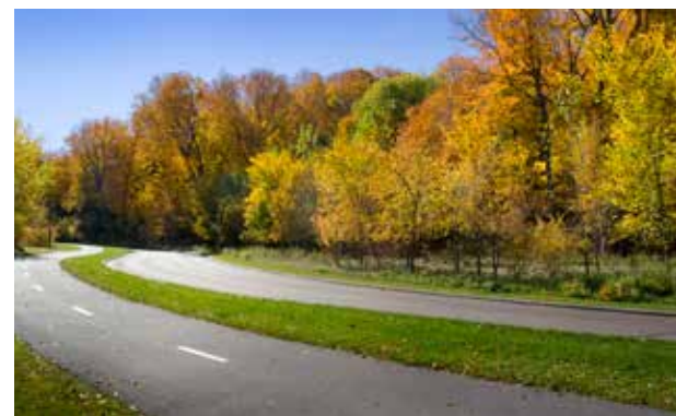
Autumn Parkway in Minnesota.

Many of the sustainable highway practices presented by INVEST promote cost savings and benefits to social, environmental, and economic systems. For example, items such as quality construction, designing pavement for long life, life-cycle concepts, recycled materials, and improved safety can all show an overall lower cost as well as benefits to society. The goal of INVEST is to encourage sustainable principles to be applied to the largest extent practicable on highway projects. Some of the agencies that are already piloting INVEST include Minnesota, North Carolina, and Ohio.