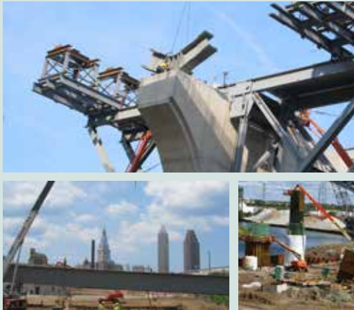
Cleveland Innerbelt Bridge.

In February 2009, the Ohio Department of Transportation initiated the first of two projects designed to replace the aging steel truss bridge that carries Interstate 90 over the Cuyahoga River Valley and into Cleveland's central business district. The first Innerbelt project, developing a new westbound bridge adjacent to the existing bridge, demonstrates how Ohio DOT is working to make its major transportation investments leaner and greener by reducing cost, maximizing benefits, and conserving resources.