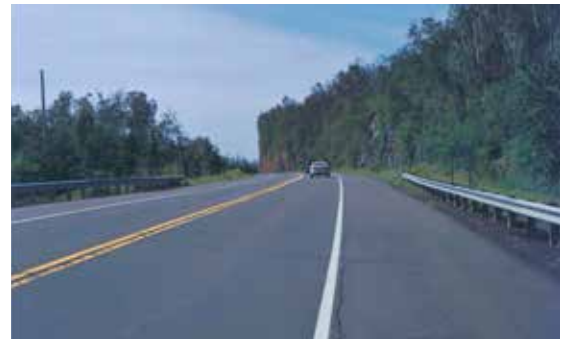
Minnesota, MN Trunk Highway 61. 2010 Perpetual Pavement Award Winner.