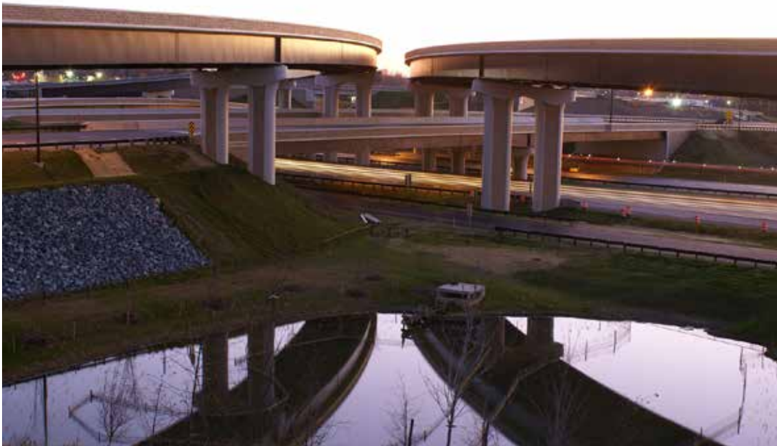
ICC Interchange.

Learning from its experience in delivering complex highway improvements like I-95's Woodrow Wilson Bridge and the Intercounty Connector in the Washington, DC suburbs, SHA recognized the need for a new generation of data-driven decision-support tools.