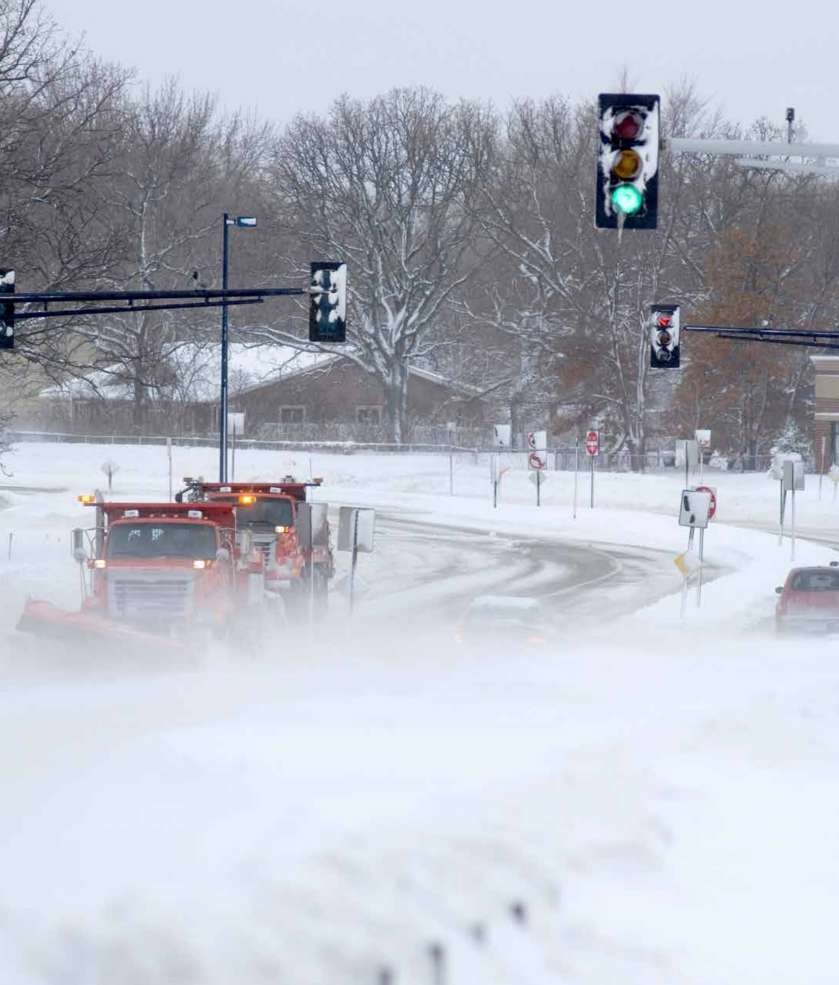
Plows clear the roads in Minnesota