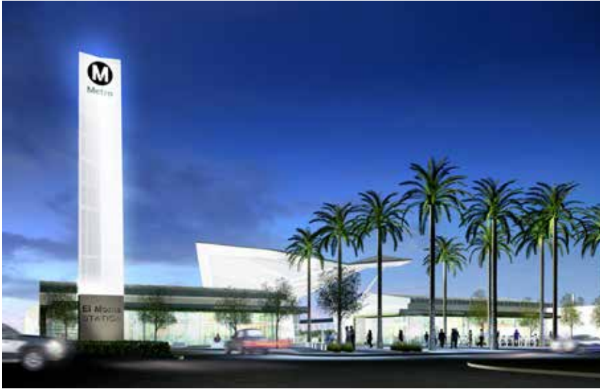
LACMTA bus hub.

facility to be awarded a gold Leadership in Environment and Design (LEED) rating. The new building cuts energy use by 25 percent and water consumption by 50 percent compared to a conventional structure, thus saving LACMTA over $75,000 in utility costs each year; 24