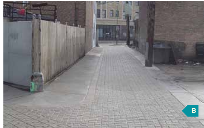
A) Alley with impermeable pavement and poor drainage. B) Alley incorporating green alley principles.