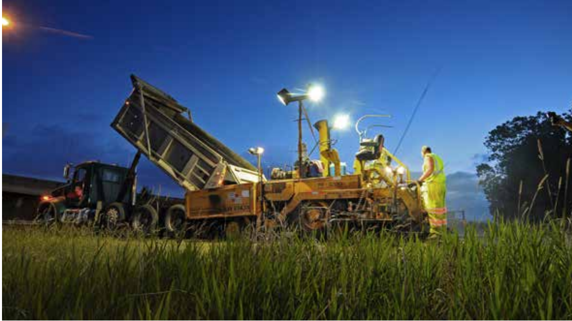
Night paving operations, Hwy 51, Arden Hills, Minnesota.

These commitments are evident in a wide range of actions underway at DOTs across the nation: