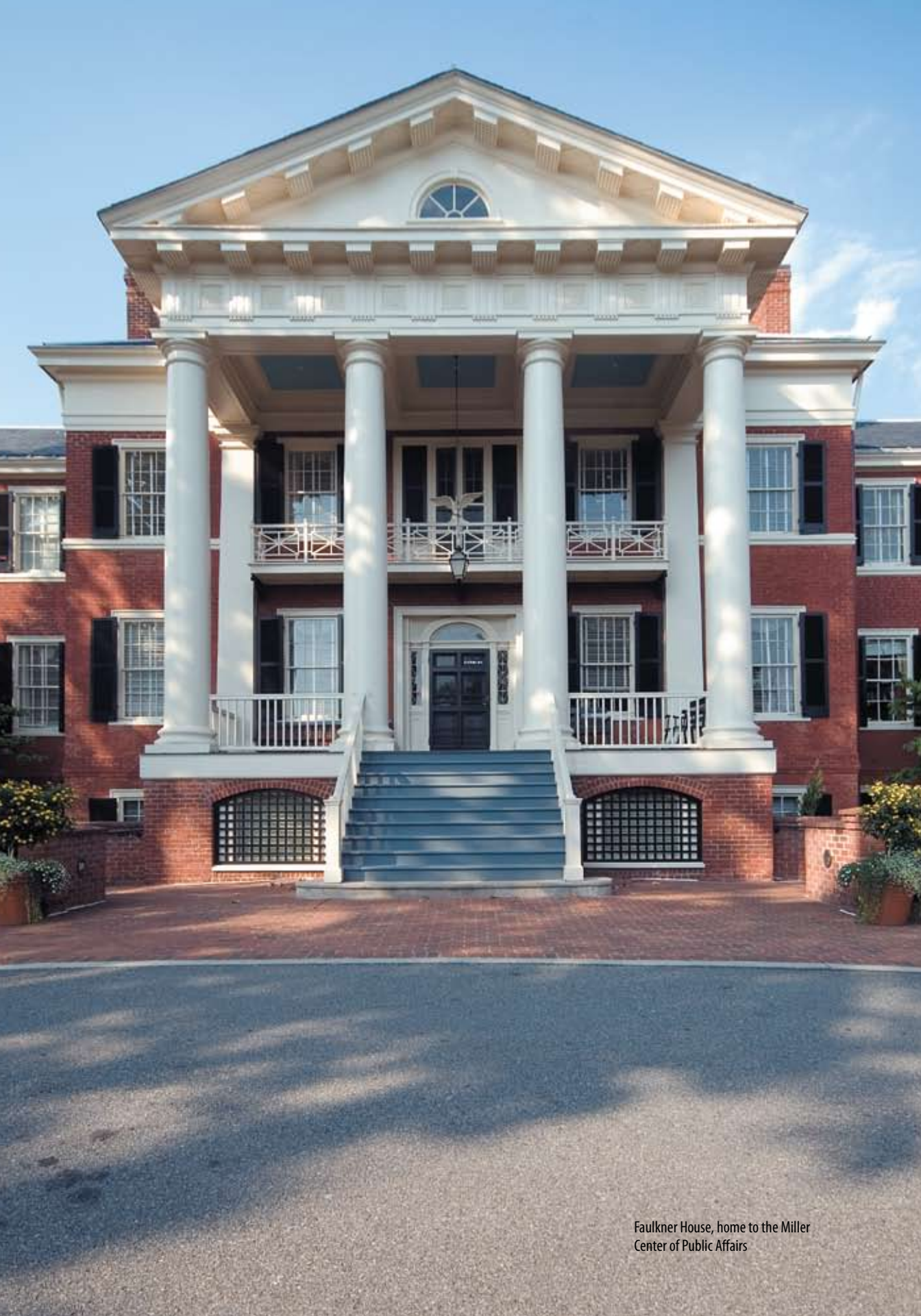
Faulkner House, home to the Miller Center of Public Affairs