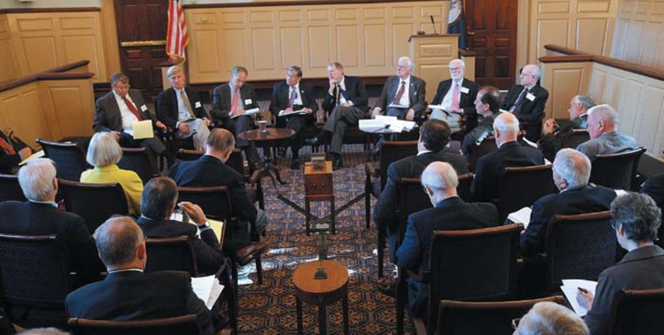
The final session dedicated to the formulation of recommendations was led by panel moderators from previous sessions.

provided insight, guidance, and leadership as the Conference Co-Chairs. Conference participants included representatives from all modes of transportation and government agencies at the local, state and national level. Current and former transportation policymakers were present, and attendees also represented a wide array of academic, environmental, and business interests. We were delighted with the caliber of the people who attended as well as the informed discourse and the signs of consensus-building evident at the close of the conference.