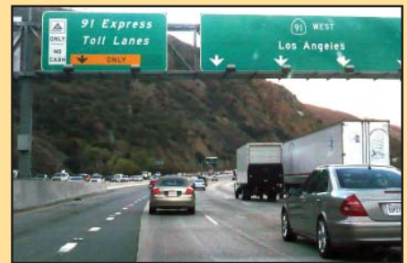
SR-91 express lanes, California

Studies have shown only half of the drivers using SR-91 Express Lanes do so more than once a week, and women are more likely to use the lanes than men. FHWA analysis showed during the afternoon rush hour, two express lanes carried almost the same number of drivers as the four "free" lanes because drivers were able to move faster. Those who choose the "free" lanes also benefit because the addition of four new lanes helped alleviate the traffic problems along the corridor. The express lanes can offer up to a 20-minute travel time savings and provide drivers an alternative when time is of the essence. As a result, SR-91 Express Lanes have gained popularity, with traffic volume on the lanes increasing by 67 percent in the first 10 years of operation, serving as a model for cities nationwide.