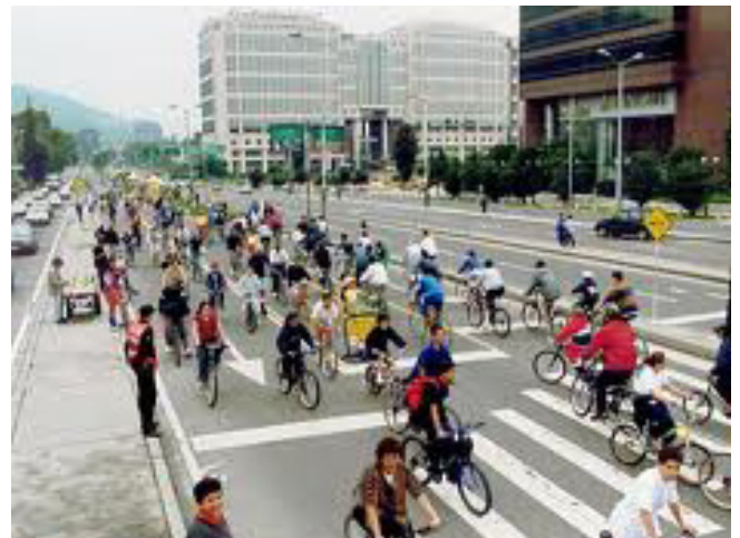
Ciclovía spurred the pedestrianization of streets and the transformation of vacant lots into parks. This increased the amount and quality of public space in the city.