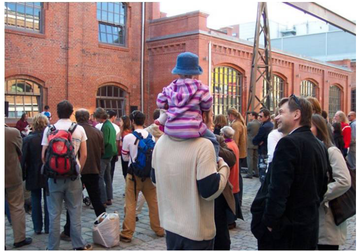
Vankovka factory after.