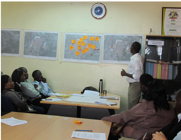
Presenting recommendations at the Power of 10 workshop in Nairobi.

In order to make the space even more attractive and safe for Kibera's residents, PPS recently met on site with local residents and city council staff to brainstorm about how to create synergy and connections among the facilities already located here, including a primary school, a public toilet, a community garden, a playground, a river, a pottery studio, a meeting hall, and a resource center. The focus became less on the sports field and more on how to maximize the use and potential of all of the resources at Silanga Sports Field, to make it a true destination for the neighborhood, creating a ripple of positive effects. This is the Power of 10 at work.