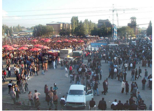
The site was used for a three-day festival of art, food, and experimentation which turned this long-neglected site into a vibrant central square.