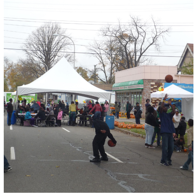
As there was no formal public space, the festival was held in the street and the parking lot of the produce market.