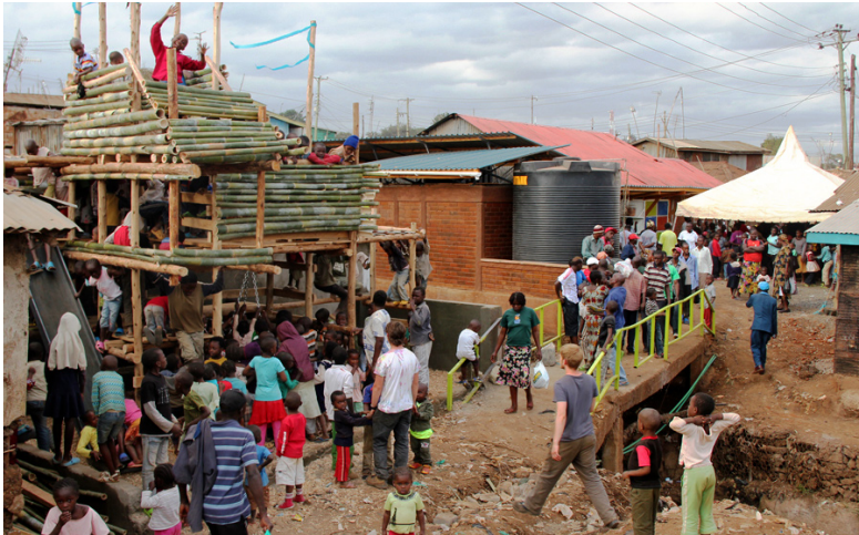
Kounkuey Design Initiative (KDI) transforms impoverished communities by collaborating with residents to create low-cost, high-impact built environments (Productive Public Spaces) that improve their daily lives.