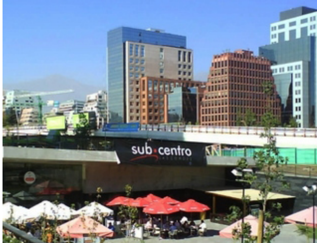
SubCentro after the redesign based on a collaborative placemaking process

Despite being in one of the most important neighborhoods in Santiago, Chile, anchored by one of the busiest train and bus stations in the city, the Las Condes plazas and commercial galleries had become