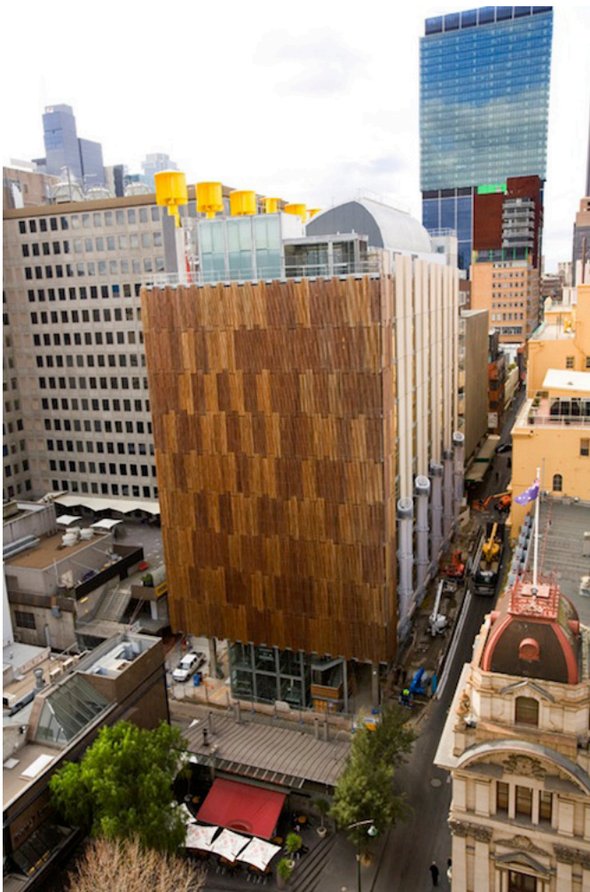
The design of CH2 is beautiful and environmentally sound.

But it is much more than just a showcase "green" building. At the ground level, it is dynamically connected to the surrounding neighborhood, fostering street life and creating a strong sense of place. The area around the building is enhanced by shade structures and other amenities, making this a comfortable place and an integral part of the community and creating a friendly, healthy microclimate in its immediate vicinity. It shows that "iconic" architecture need not be divorced from the urban fabric. The best architecture exists in constant dialogue with the people and places around it.