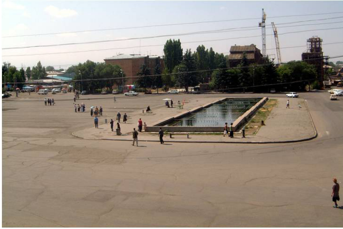
The site that housed refugees after the Armenian earthquake.