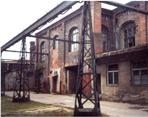
Vankovka factory before.

In Brno, the Czech Republic, the Vankovka factory, with PPS assistance, was saved from demolition and designated an historic landmark. An NGO was set up to promote a community-based vision for the complex, an impressive series of industrial halls and loft spaces located adjacent to the historic city center. The NGO sponsored hundreds of events in the space, making temporary improvements to make the spaces usable. Based on the popular support, the city purchased the factory complex. The former factory is now a thriving shopping center and events venue, with shops, cafés, and restaurants -- a real destination for the city of Brno.