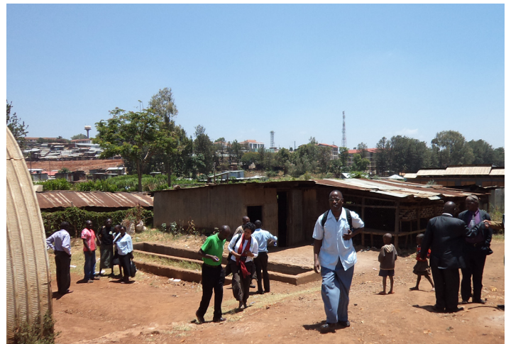
The Kibera Silanga sports field as it looks today.