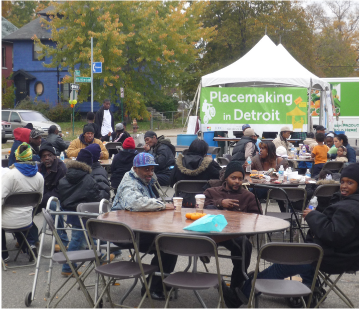
A harvest festival and community celebration temporarily transformed the atmosphere in an inner-city Detroit neighborhood.