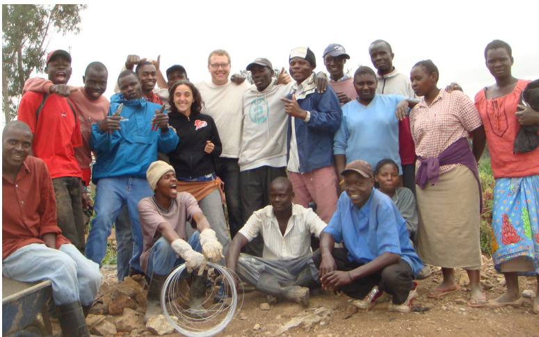
Opening celebration, Kibera Public Space Project 03.

Kounkuey Design Initiative (KDI) transforms impoverished communities by collaborating with residents to create low-cost, high-impact built environments (Productive Public Spaces) that improve their daily lives. Begun in 2006, KDI is an innovative international partnership specializing in the practices of architecture, landscape architecture, engineering, and urban planning. KDI believes that participatory planning and design are key to sustainable development. By working collaboratively with communities from conception through implementation, they build on the ideas of local residents, enhance them with technical knowledge and design innovation, and connect them to extant resources. In doing so, KDI empowers communities to advocate for themselves and address the major physical, social, and economic challenges they face.