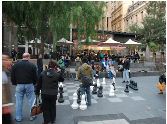
Even more important, people gather in front of it. The building is surrounded by people, doing things because there are things to do.