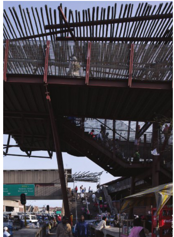
New coverings over the Traditional Medicine and Herb Market

Durban is the third largest city in South Africa, and is famous for its nature and beaches as well as its great ethnic diversity. This manifests itself in the many informal markets around the city that provide economic opportunities for the poor. These markets also create opportunities for people to socialize and for entrepreneurs to develop their creativity.