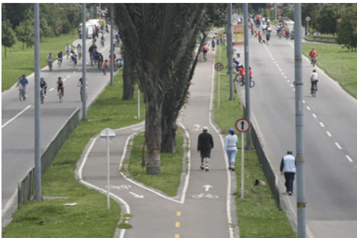
Ciclovía has reinvigorated Bogotá's city centre, increased safety, supported active living, and exercise, and created a stronger sense of community for Bogotá's citizens. The bike routes traverse the rich and poor areas of the city alike.

Peñalosa also led an effort to increase green space and playing fields in neighborhoods around Bogotá. The result has been a decrease in crime and gang activity. Many citizens who were formerly without recreational options can now enjoy safe, healthy outdoor activities that are inclusive of women and children.