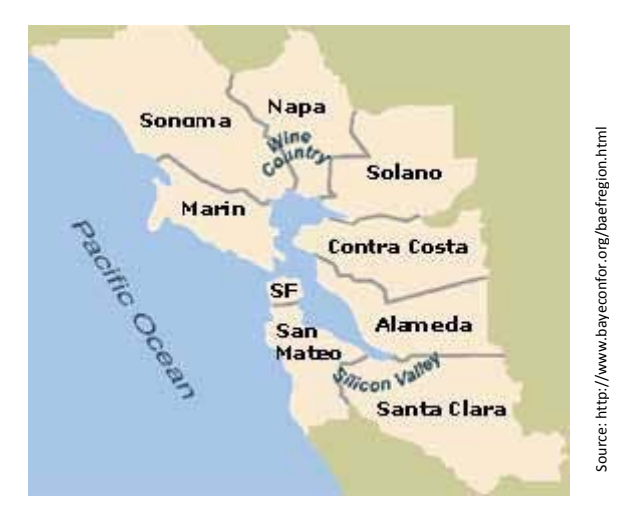
FIGURE 1. THE SAN FRANCISCO BAY AREA'S NINE-COUNTY REGION

Located in Northern California, the San Francisco Bay Area provides a wonderful place to live and work for its seven million residents. The area consists of 101 cities in the nine counties that touch the San Francisco Bay<sup>1</sup>.