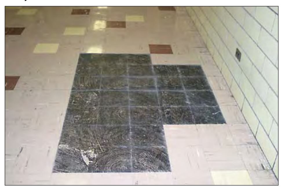
16 / American Federation of Teachers

■ In Baldwin, N. Y. , AFT members participate in the district's very active health and safety committee. The committee formulated an IAQ document that is used as a standard in other districts. Air quality issues are investigated within 24 hours of a complaint being filed. When an addition was built to Baldwin's middle school,