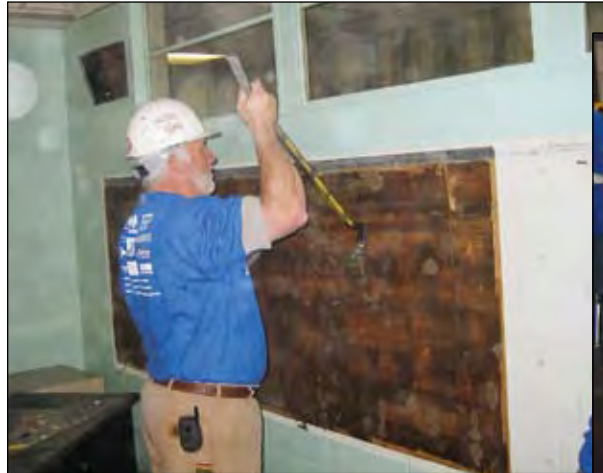
A construction team member (above) working hard to provide school children with improved space (right).