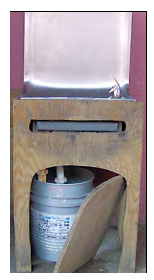
Water efficiency is a key element of sustainable design, sorely lacking in this Virgin Islands school.