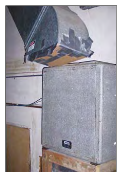
HVAC systems in many schools are in a bad state of disrepair.