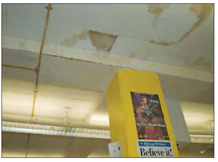
14 / American Federation of Teachers