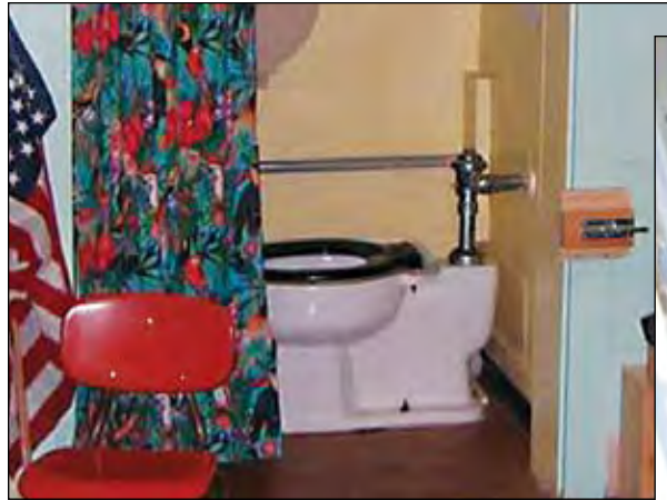
Before: Only a thin curtain separated this bathroom from the classroom.

After: An almost-renovated bathroom will be much more sanitary and easy to maintain.