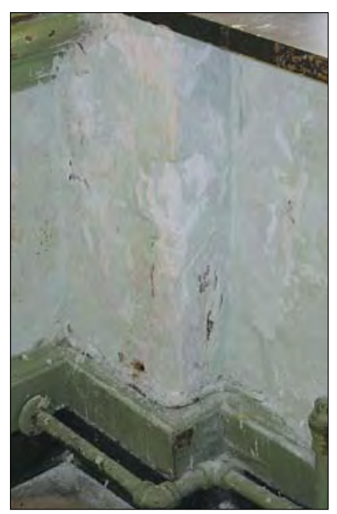
Age and neglect have left the walls in some schools—like this New York classroom—literally crumbling.