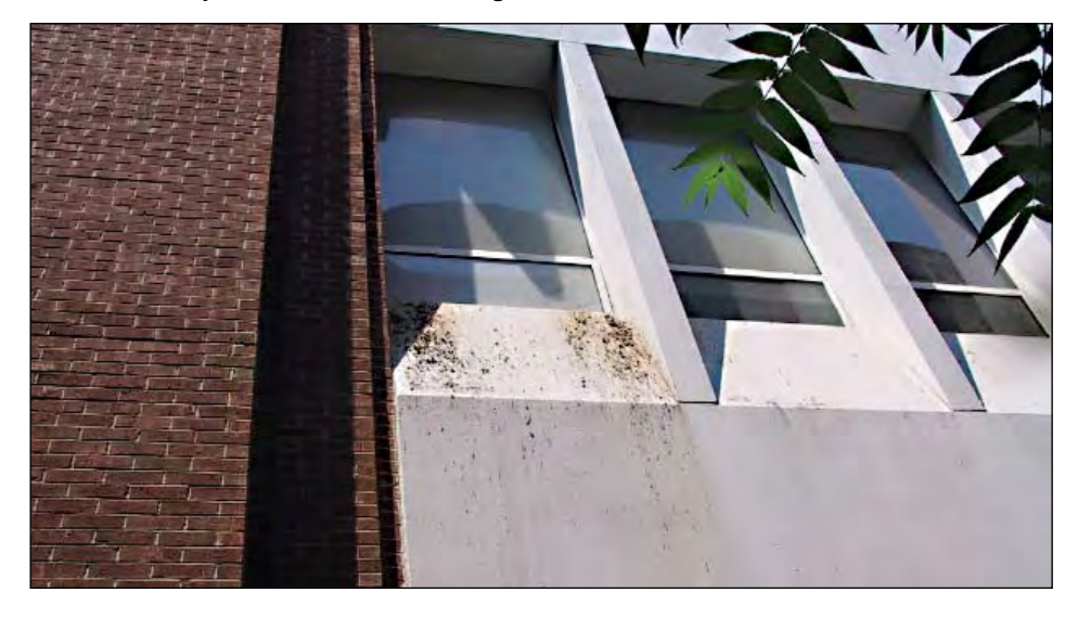
Mold outside classroom windows is evidence of more serious problems inside the building.