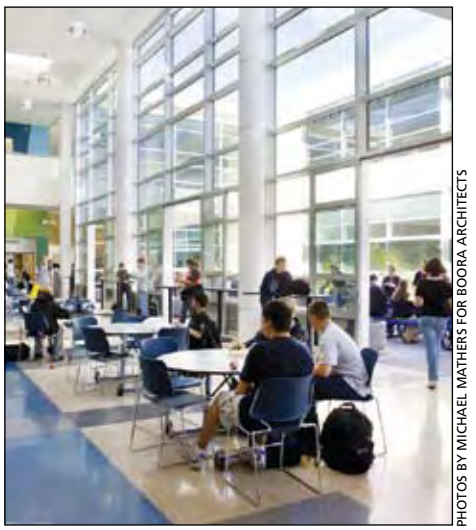
With thoughtful designs and strong maintenance standards, school buildings can be places that students look forward to spending time in every day.

NATIONAL LEADERSHIP, WHICH CAN DRIVE local action, should make the case for high-performance school facilities by highlighting best practices, and exposing and seeking to change unhealthy conditions. It should promote sustainable schools by encouraging school districts to adopt the concepts of high-performance and sustainable design. But national leadership must go a step further to make sure that school districts have the resources they need to renovate and build schools.