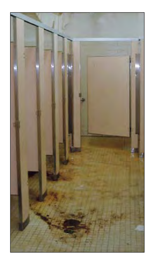
Building Minds, Minding Buildings / 15

Committee, which makes sure the principal follows up with a work order for necessary repairs. Second, if repairs aren't made, the union then directly contacts Chicago Public Schools officials. Finally, if the problem is not fixed, a complaint is filed with the Illinois Department of Labor, which will visit the site and issue citations, if necessary. Examples of recent problems reported include large amounts of dust in a building from external sandblasting, ceiling tiles falling on the heads of students and staff, and dangerously loose floor tiles. The union newspaper regularly highlights unsafe building conditions as well as the union's actions to protect students and staff.